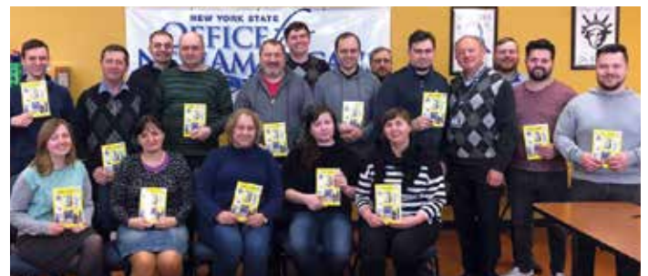
▲ Former Soviet Union refugees with OSHA certificates.