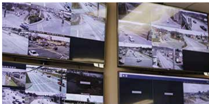
▲ Camera footage used by the Mohawk Valley Transportation Management Center to monitor and manage traffic.