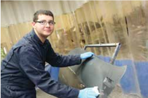
▲ An auto body student works in the lab.