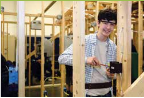
▲ An electrical trades student learns his craft in the classroom.