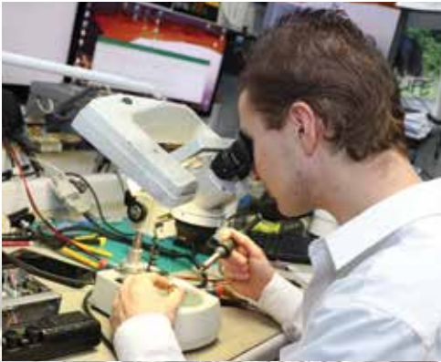
▼ A new vision engineering student works at an internship.