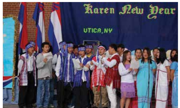
▲ Performers sing during the Karen New Year celebration.