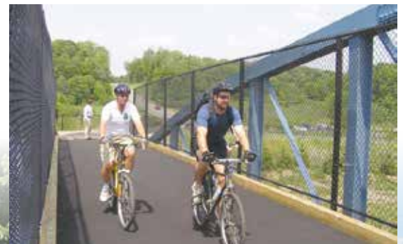
► Cyclists on a pedestrian bridge.