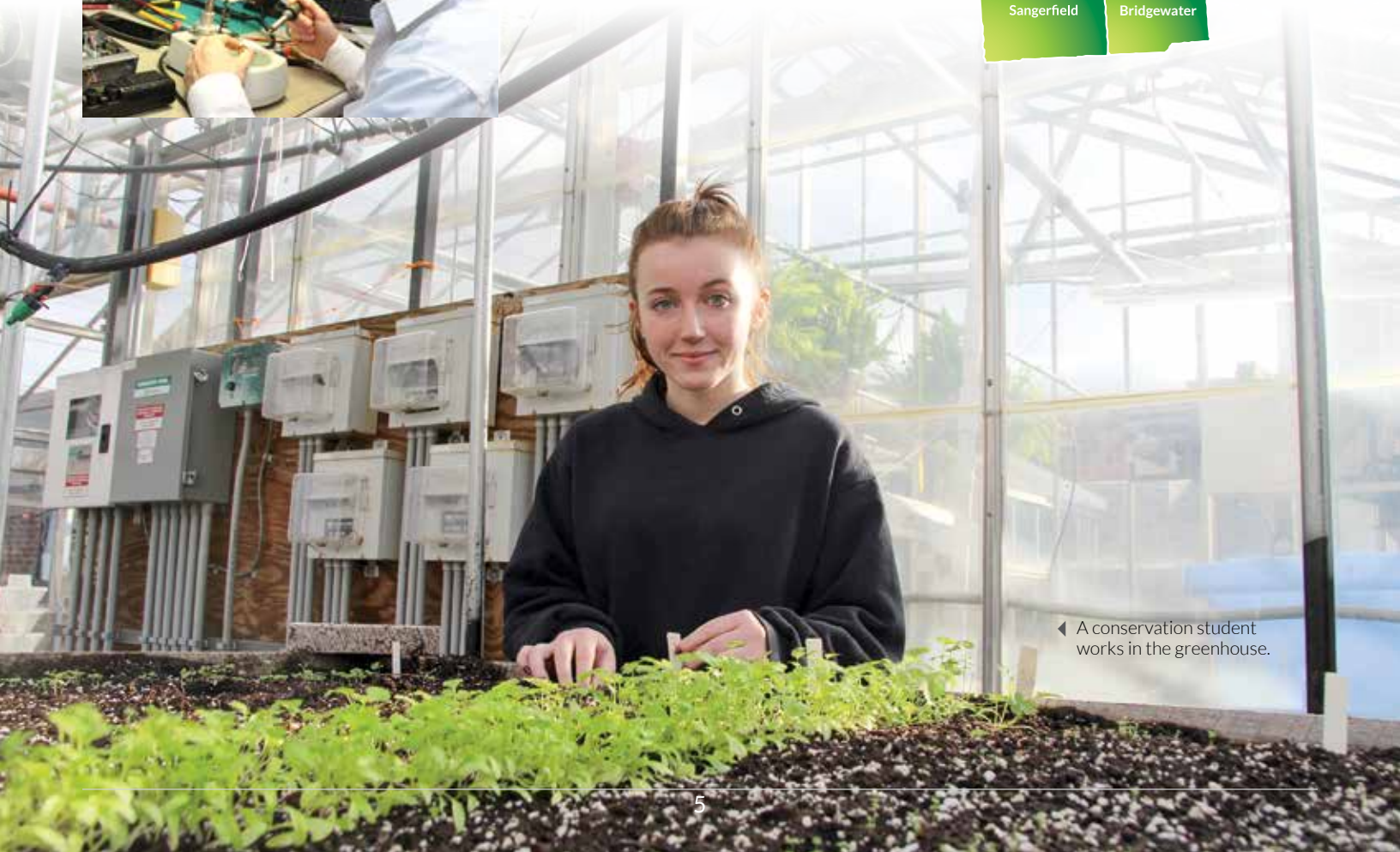
◀ A conservation student works in the greenhouse.